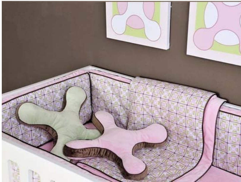
Geo Pink and Green

TAGS: FASHION & GEAR - DEALS , FASHION & GEAR - NURSERY , REVIEWS